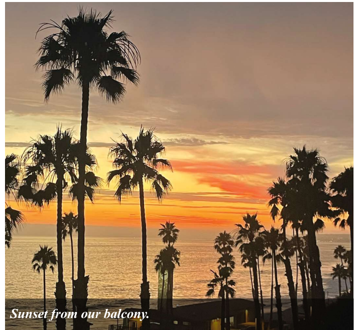
Sunset from our balcony.

owner's lounge, a grill, and a spa available for guests. The setup is perfect for relaxing after a long day at the beach or exploring the town.